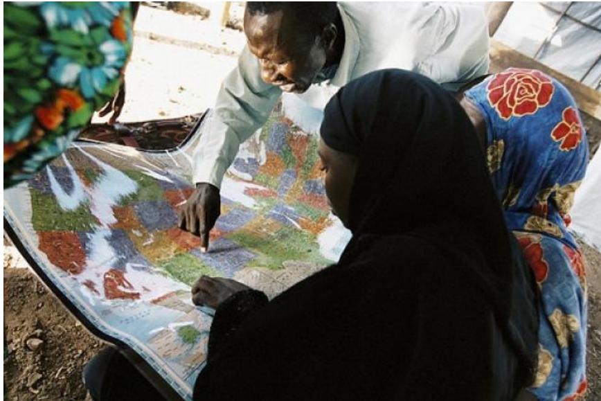
UN Migration Agency